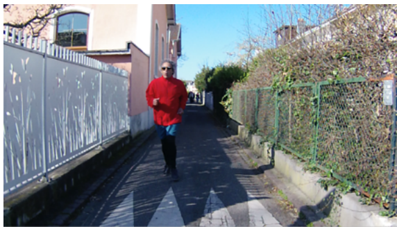
« L'homme qui court III » (screenshot), 2026 Filmed performance at passage de la Salle d'Asile, Mulhouse Production La Kunsthalle Mulhouse © Hassan Darsi, ADAGP