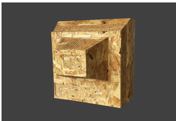
« New Babel II », 2026 OSB Production La Kunsthalle Mulhouse © Hassan Darsi, ADAGP

The day after 11 September 2001, Hassan Darsi meticulously covered his television set in gold adhesive, binding the uninterrupted flow of images broadcast by media outlets around the world within this gilding. Born of immediacy and violence, “New Babel” questions the role of the media as the controversial force behind a new form of image enslavement. Twenty-five years later, the artist reconstructs the same television set in OSB (a wood based material used in construction) as if the object, stripped of its golden veneer, had been returned to its bare structure. And yet, the materials used are still both substitutes – first for gold, then for wood – and each acts as a revealing element. What gold once reflected in its brilliance, wood now exposes in its rawness, the impermanence of certainty and the fragility of a world still under construction..