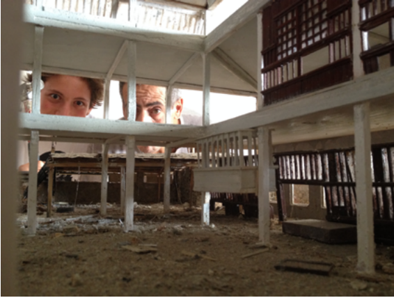
« Le square d'en bas », 2017 Model, mixed media 60 x 170 x 212 cm © Hassan Darsi, ADAGP