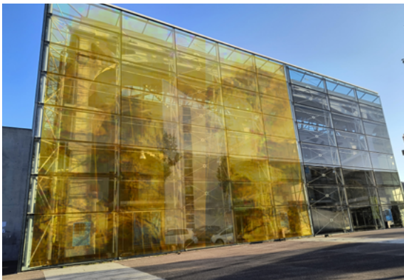
« Façade dorée » II, 2026 Intervention à l'adhésif doré sur la façade de La Fonderie. Mulhouse, juin 2026. Production La Kunsthalle Mulhouse. Mécénat : Prevel Signalisation © Hassan Darsi, ADAGP