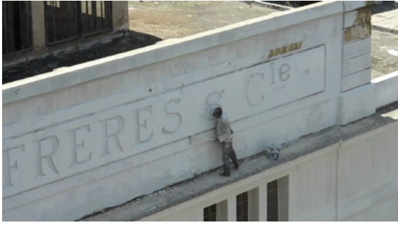
« Zone d'incertitude », 2014 Video HD, 16/9, 16'03 © Hassan Darsi, ADAGP